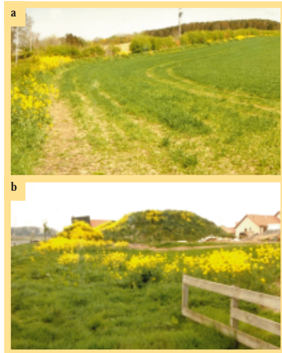
Figure 3 (a) Population of oilseed rape in field margin (North East Fife, April 1993); (b) Population of oilseed rape occurring on ex-agricultural soil (Tayside, June 1993).

Geneflow between agricultural fields The mean distance between cultivated oilseed rape fields was 0.9 km and approximately 10% were situated within 100 m of one another. These distributions suggest that