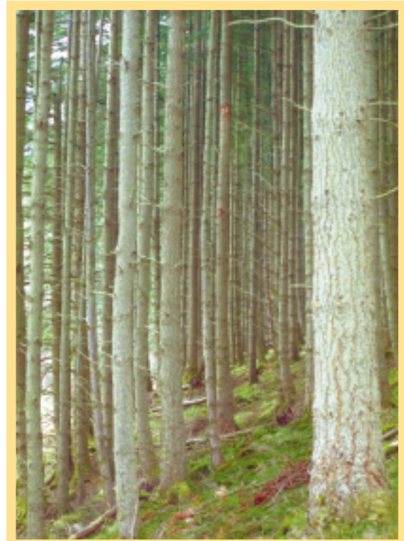
Figure 1 Mature trees.

The programme at SCRI has aimed to combine existing expertise in genetics, breeding, wood chemistry and molecular skills of SCRI, and the germplasm and