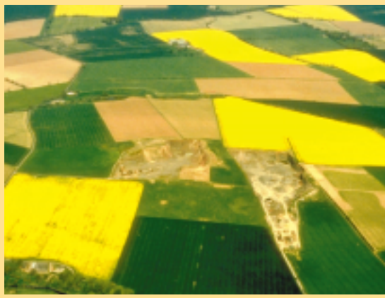
Figure 2 Aerial view of small section of area surveyed in Tayside region of Scotland (May, 1993).

Some seed set was observed on all of the bait plants. The percentage seed set declined with distance and correlated well with the decline in airborne pollen concentrations. Seeds produced on plants 2 km away from the source gave rise to plants with 38 chromosomes that were phenotypically normal B. napus , thereby demonstrating the capacity for long-range geneflow up to this distance.