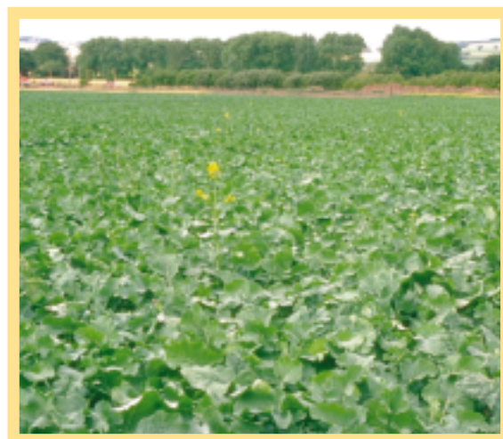
Figure 4 Large-scale screening of seed progeny collected from measured intervals within a commercial field of a winter sown oilseed rape cultivar (Falcon) situated adjacent to a field of spring sown cultivar (Comet). Flowering 'hybrid' seed (produced as a result of inter-cultivar crosses) can easily be identified amongst large numbers of non-flowering intra-cultivar crosses and selfs.

the potential exists for geneflow to occur between agricultural fields under current farming practices. The main problem associated with attempts to deter-